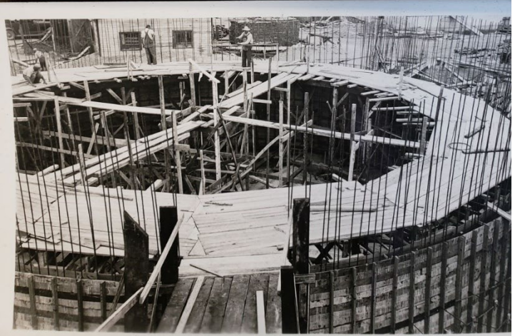
Original Wastewater and Water plants built in 1930s as WPA projects